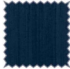
04 French Navy