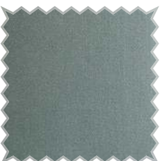
20 Copper Oxide

A soft and smooth fabric produced using a combination of cotton and polyester fibres, combed to create a luxurious satin finish.