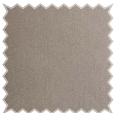
18 Almond Cream