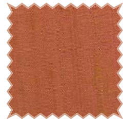
11 Firefly Orange

Our 100% silk dupion is a natural handwoven fabric, unmistakably evident by a richness and variety of colour and texture. The fibre's triangular structure acts as a prism that refracts light, giving the surface of the fabric a lustrous sheen. As a natural fibre the texture and slub of silk dupion is characterised by variations and irregularities in the shade and weave.