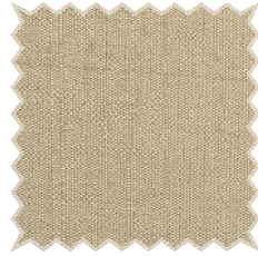
41 Sea Mist Gold